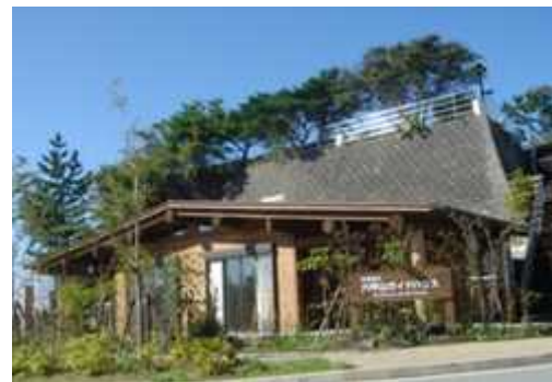
Mt. Rokko Guide House