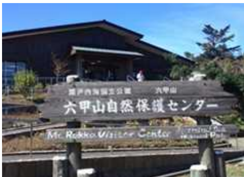
The Main Building